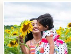
September Events in the Finger Lakes