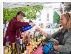
Fall Events & Festivals