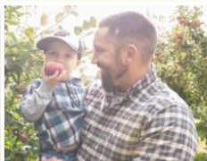
The Ultimate Finger Lakes Fall Fun Guide

For an up-to-date New York Fall Foliage Report, click here !