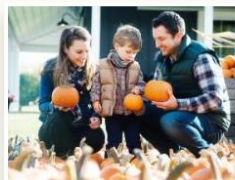
U-Pick Farms in the Finger Lakes